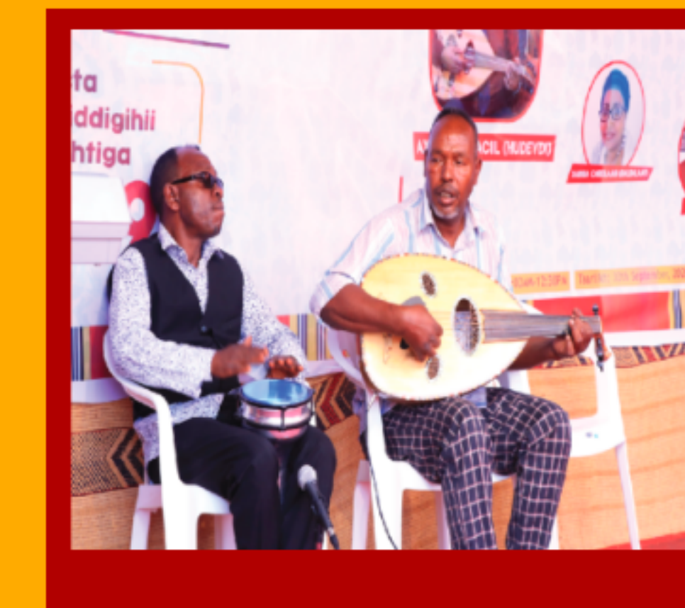
Somali drummer along with guitarist (Kaban Player)