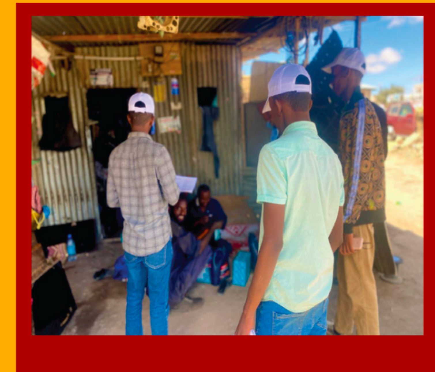
MASAF team conducting the door-to-door campaign