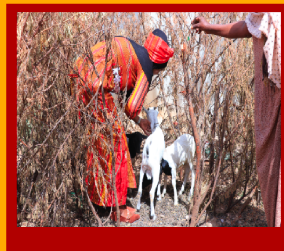
Female in traditional clothe, caring for young sheep.

IF THE MENTALLY-ILL PERSON COULD SANELY TALK, WHAT WOULD HE/SHE SAY?