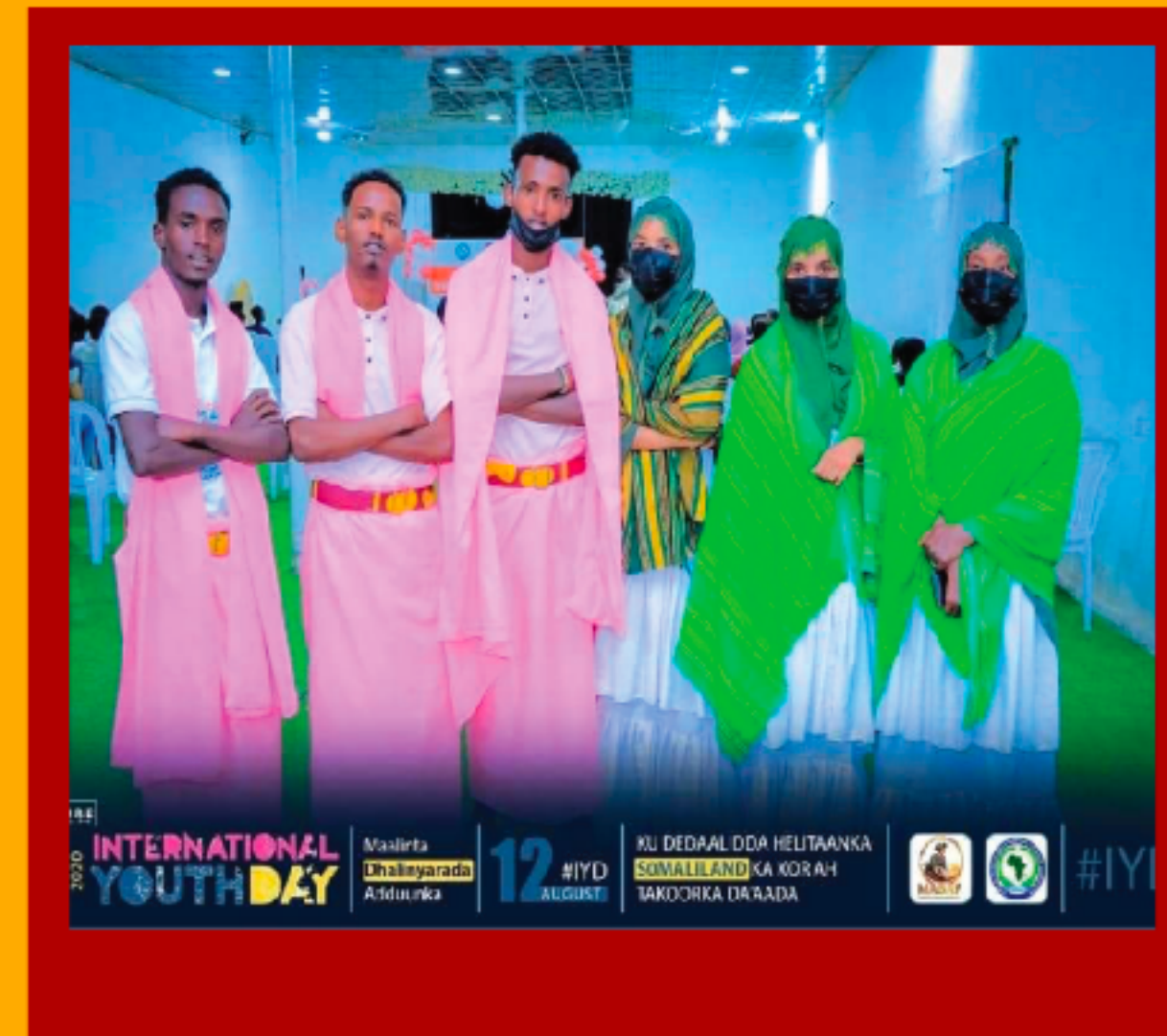
Sanag region, celebrating int'l Youth day.