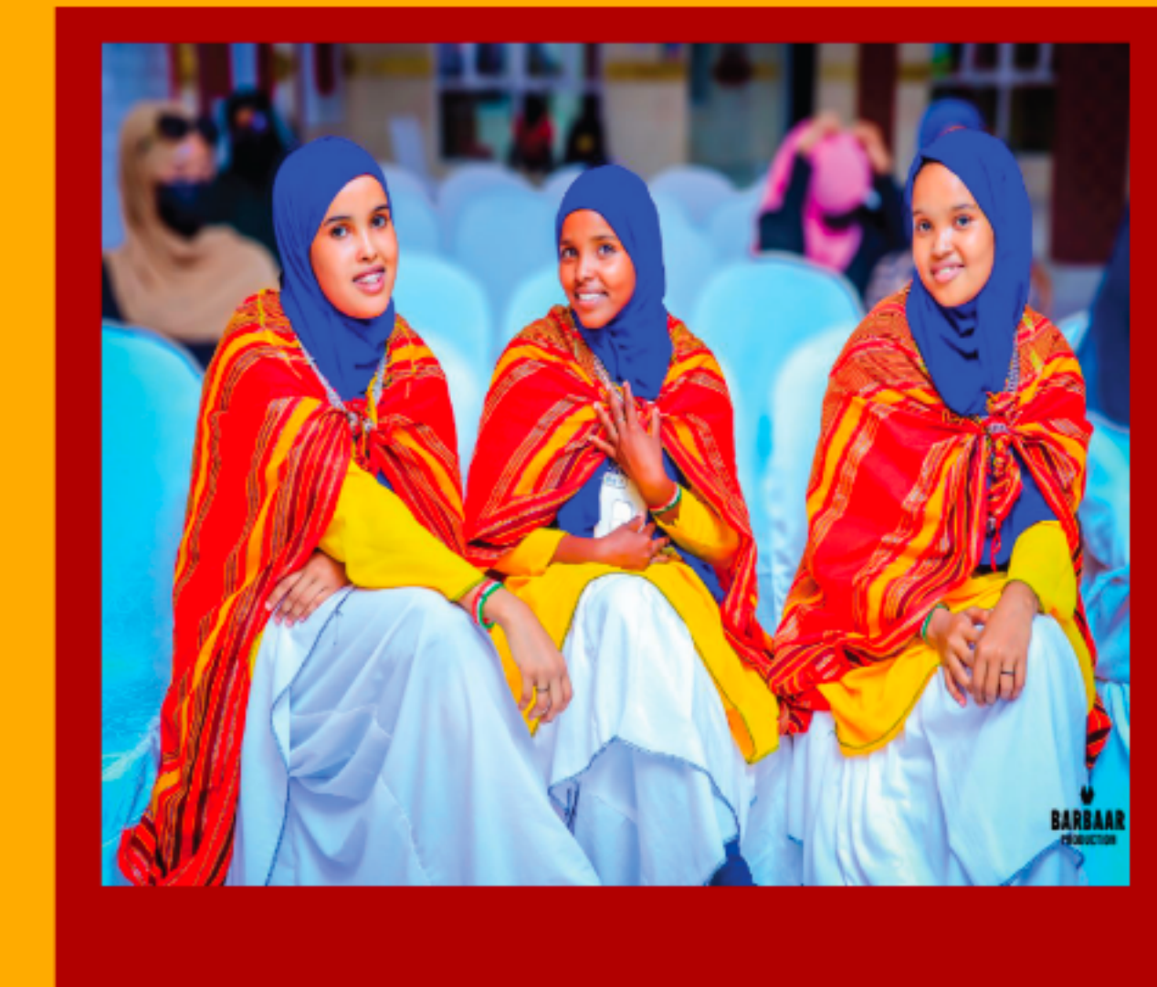
Togdheer region, dedicated to the emergence of visionary young leaders.