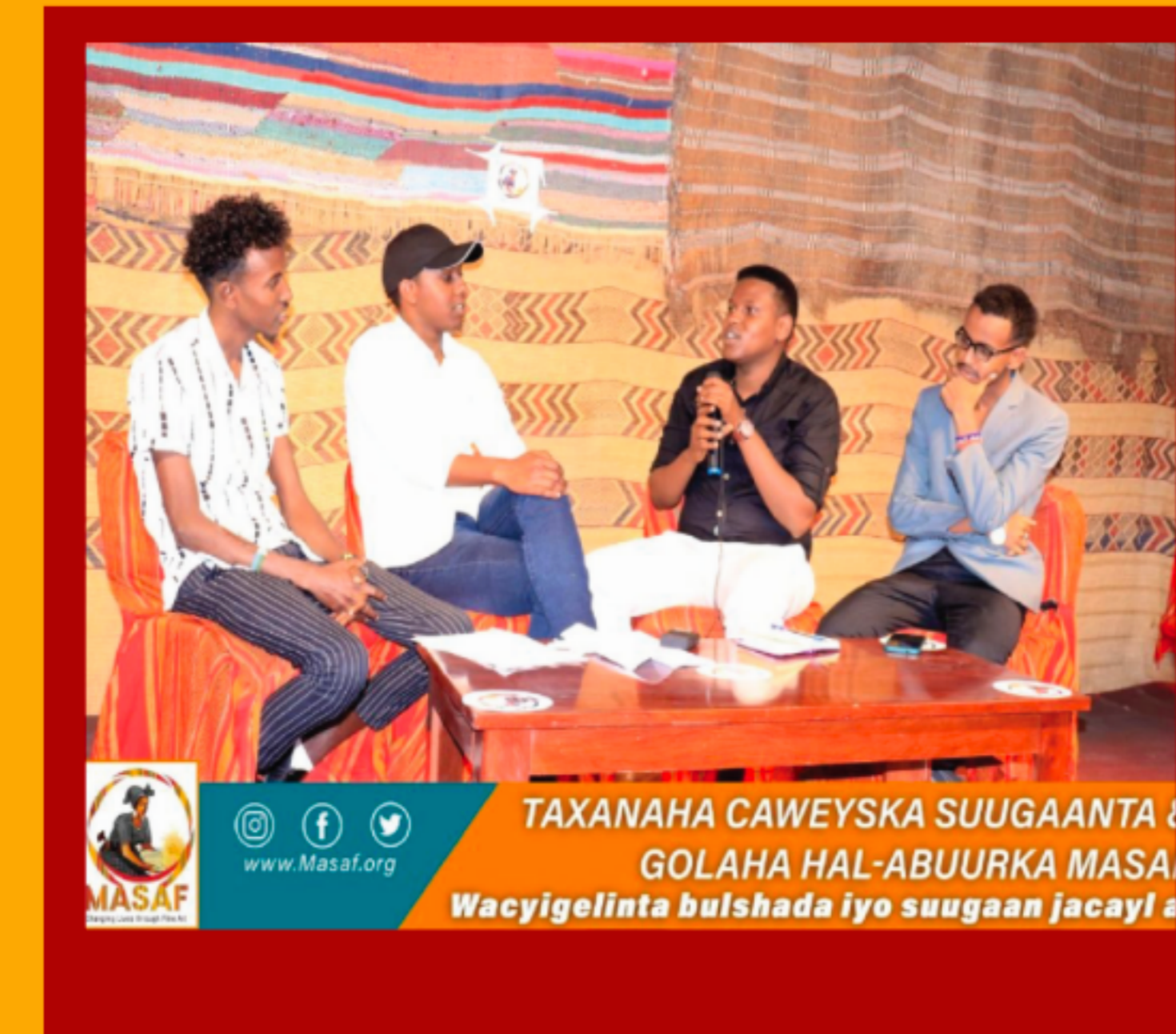
Young poets performing at MASAF's stage