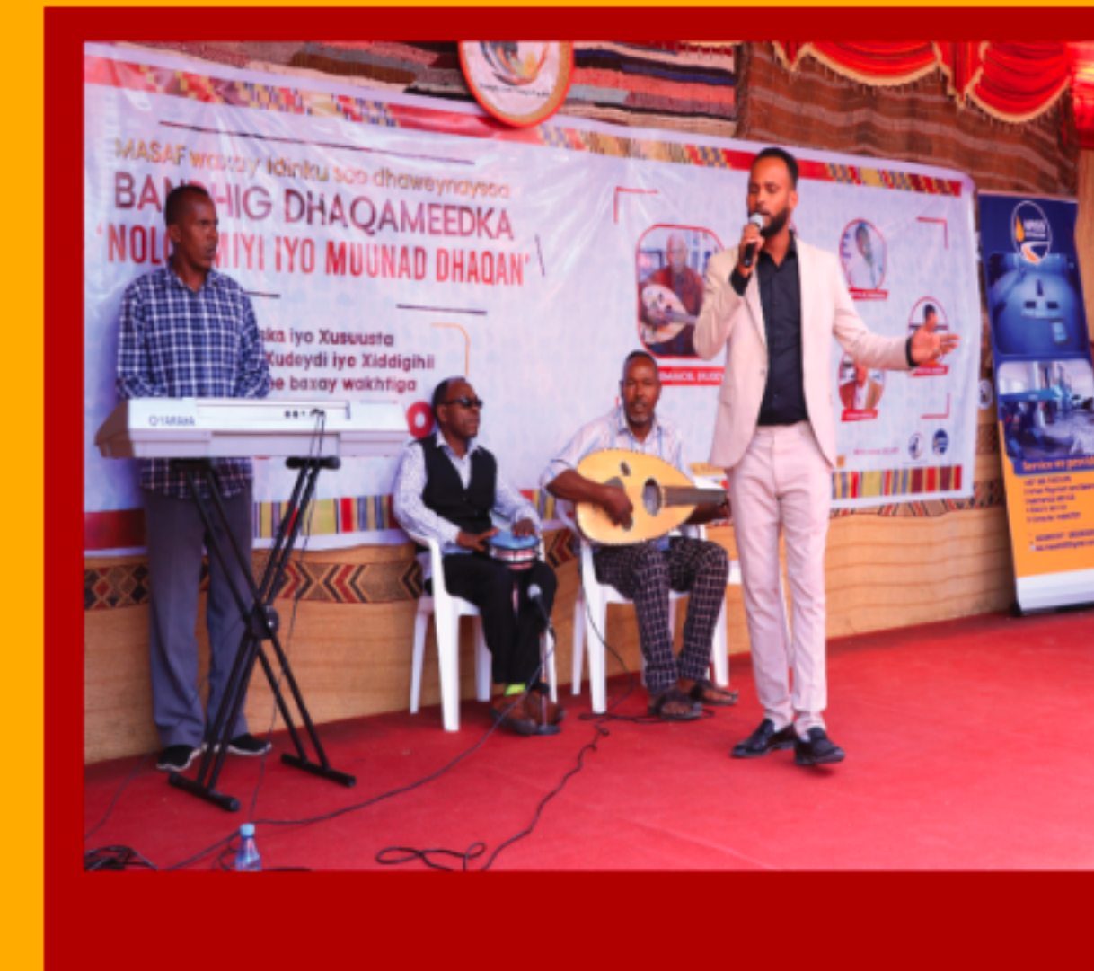
Songs of famous Somali singers being sang as act of paying tribute