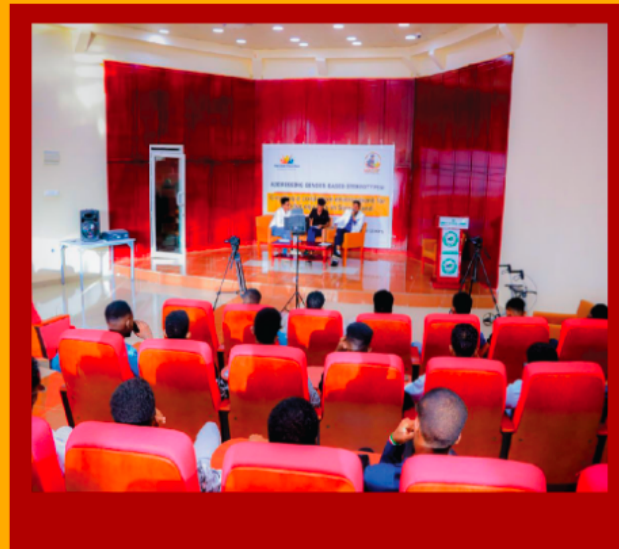
Gabiley region, dedicated to addressing gender-based stereotyping