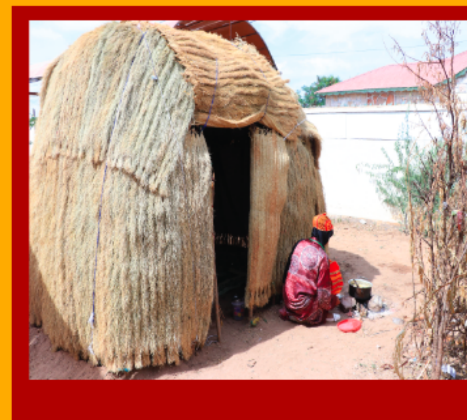
Traditional Somali hut