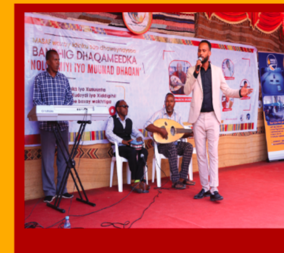
Songs of famous Somali singers being sang as act of paying tribute