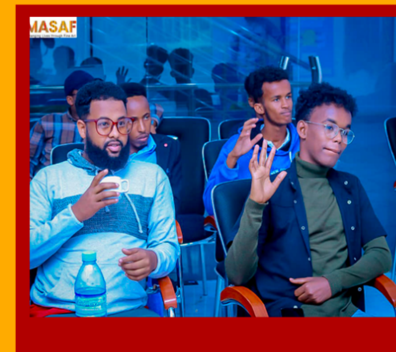
Documentary Showcasing on "Africa's Looted Art"