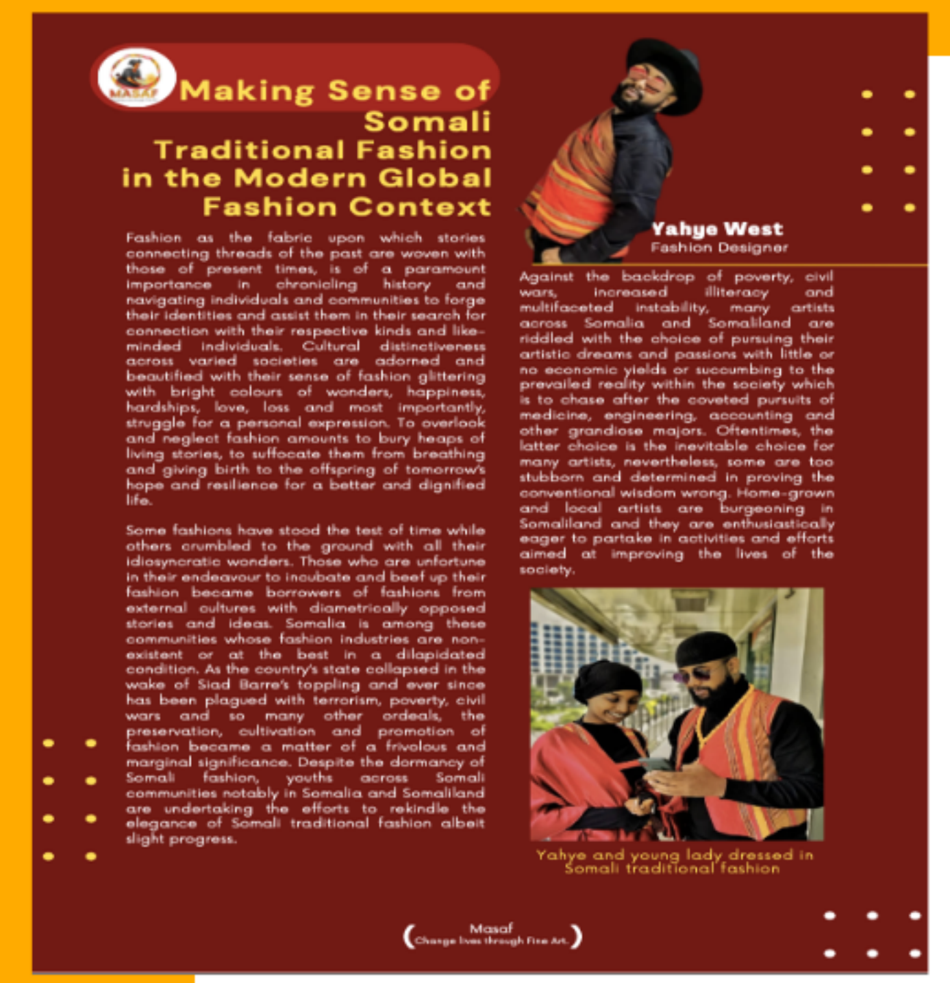
Masaf Changing Lives through Fine Art

A small article on “The Vibrancy of Somali Music industry in 1970s is resurrecting: Youth are reviving long lost vitality of Somali music industry.”